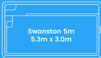
Swanston 5m 5.3m x 3.0m